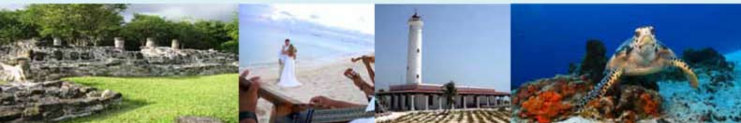
BOTTOM (from left to right): The San Gervasio ruins; a wedding on Passion Island; Hawksbill Turtle and Cozumel lighthouse in Punta Sur Ecological Park TOP: Kayaking over the calm waters of Cozumel (top left); Cozumel Country Club golf course (bottom left); Snorkeling in the protected waters of Cozumel (top right); Bicycling on the quiet roads that circle the island (bottom right)

Visit www.cozumel.travel to plan your next escape.